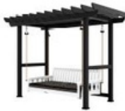
Heritage Day Bed with Brackets on the Pergola Frame