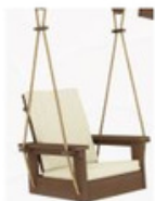
Brooklyn Swing Chair