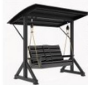
Brooklyn Lounge Swing on T-Frame with Sun Shade