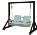
Brooklyn Lounge Swing on the Swing-Frame