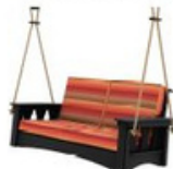
Heritage Lounge Swing