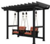
Heritage Swing Chairs on the Pergola Frame