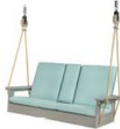
Brooklyn Lounge Swing with Center Console