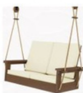
Brooklyn Lounge Swing