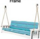
Heritage Sofa Swing